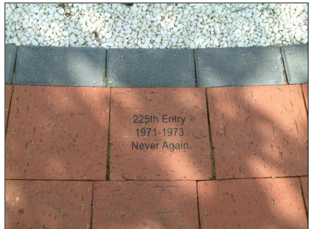
The Halton Grove at the National Memorial Arboretum - and our little piece of it.